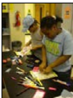
The girls writing and decorating love letters to themselves around Valentine's Day